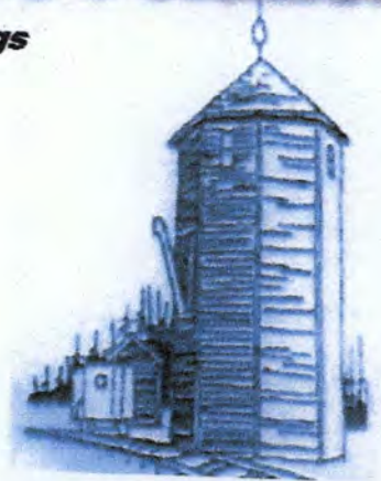
Last standing Watertower on the BC Rail line

On behalf of the 48 members of the Lone Butte Historical Association, (LBHA) we would like to apply for another $5,000 Grant for Assistance.