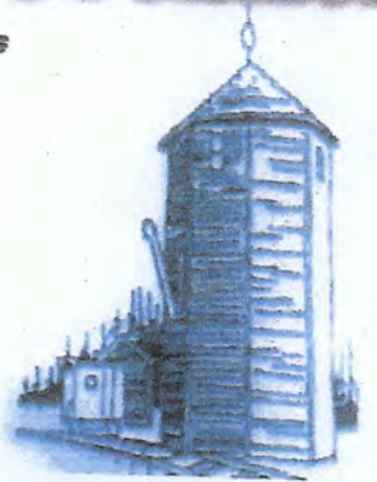
Last standing Watertower on the BC Rail Line

Our 2018 ANNUAL GENERAL MEETING is on Monday, SEPTEMBER 24, 6:30pm, in the Caboose in the Park.