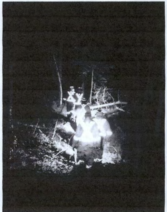
WILD LAND FIRE FIGHTING AT NIGHT JULY 2018