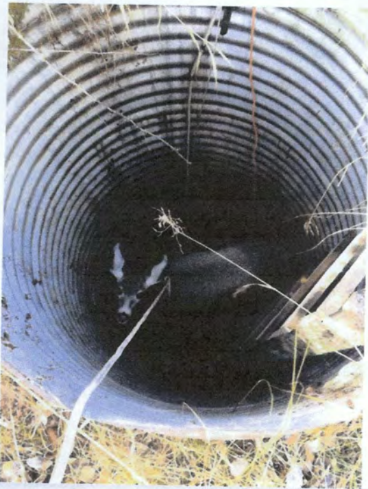
DEER IN WELL RESCUE