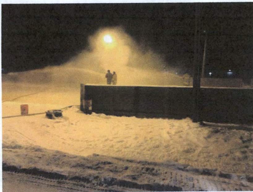
FLOODING SKATING RINK FOR HORSEFLY KIDS