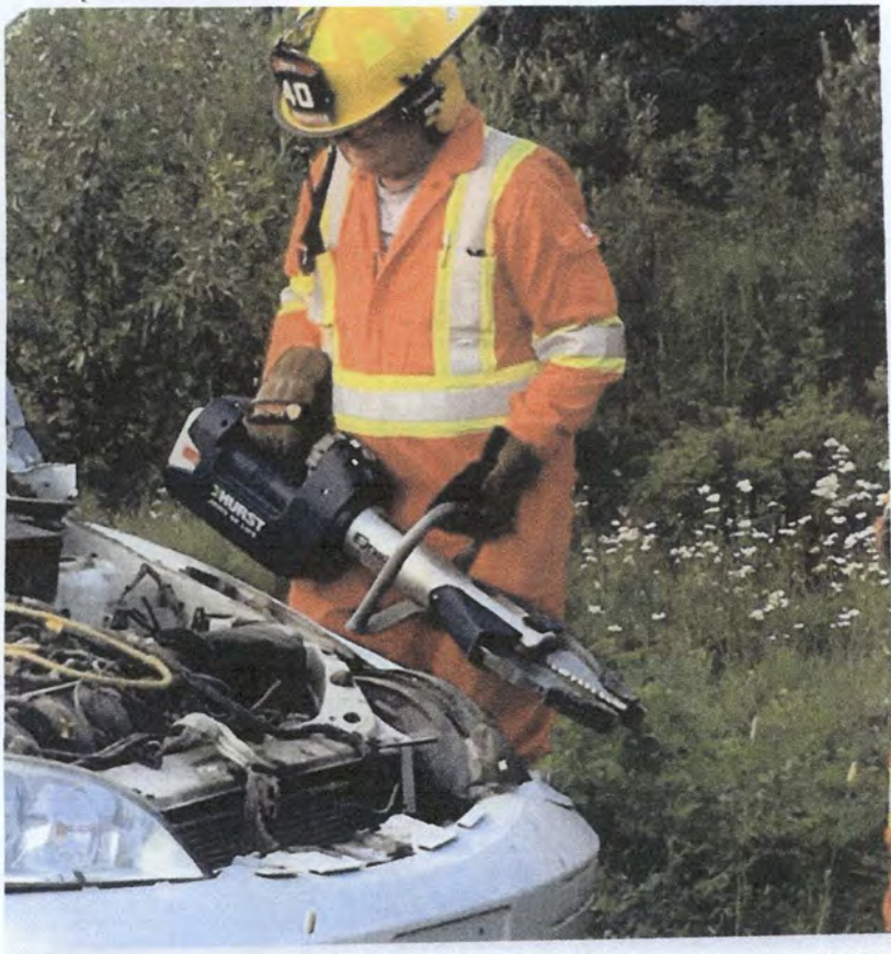
VEHICLE EXTRACTION DEMO FOR COMBI TOOL JAWS OF LIFE