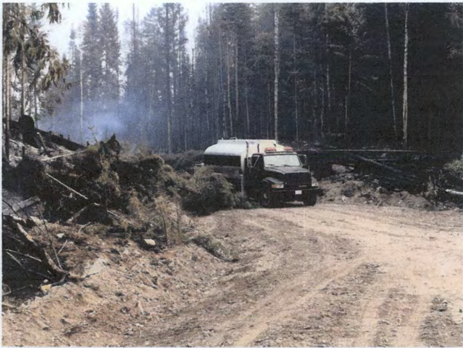
WATER TENDER WORKING AT ANTOINE LAKE FIRE JULY 2017