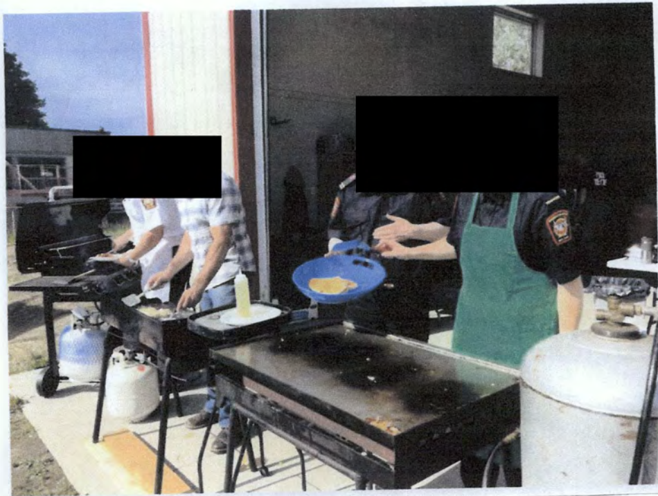
PANCAKE BREAKFAST FUND RAISER