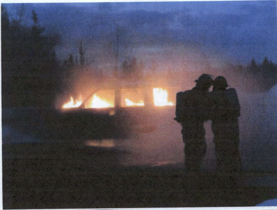
CAR FIRE PRACTICE