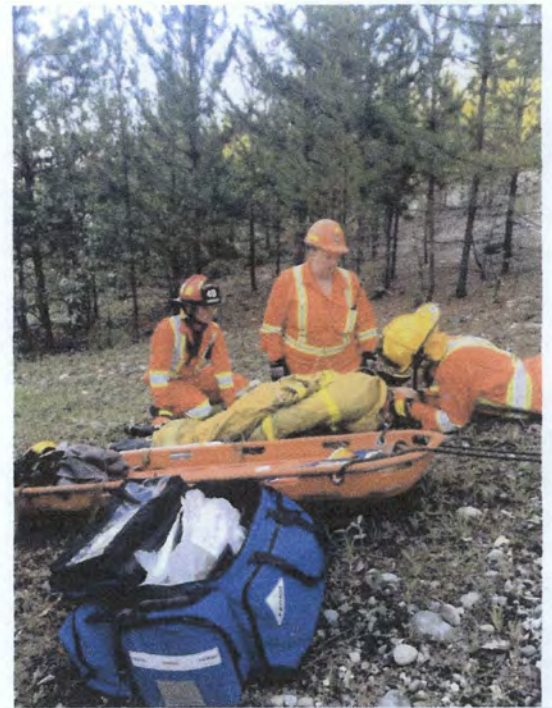
"OVER THE BANK" RESCUE PRACTICE