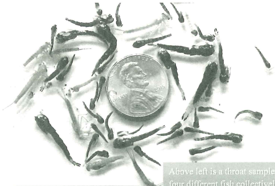
Above left is a throat sample taken in 2018 of four different fish collectively!

In previous years fish were much “fatter” than currently. (See photo of three different fish taken circa 2012 on previous page)