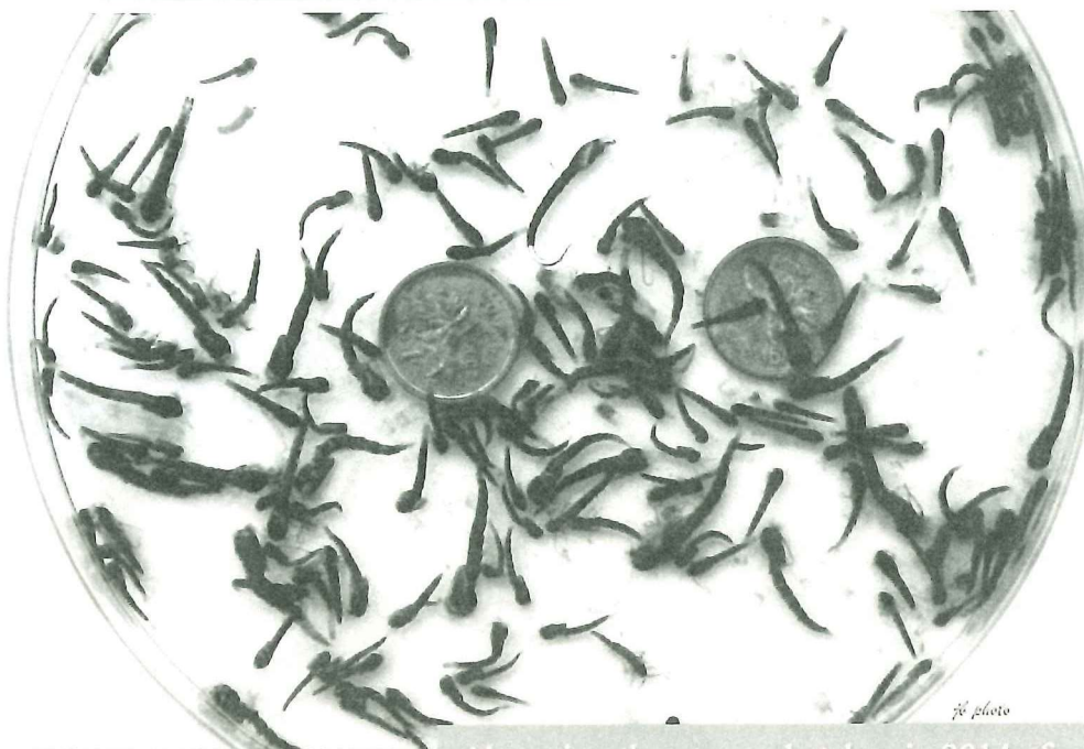
Above is a throat sample taken in 2014 of one 18” fish!

approximately 35% to 40% of all eggs harvested in BC came from Dragon Lake. At