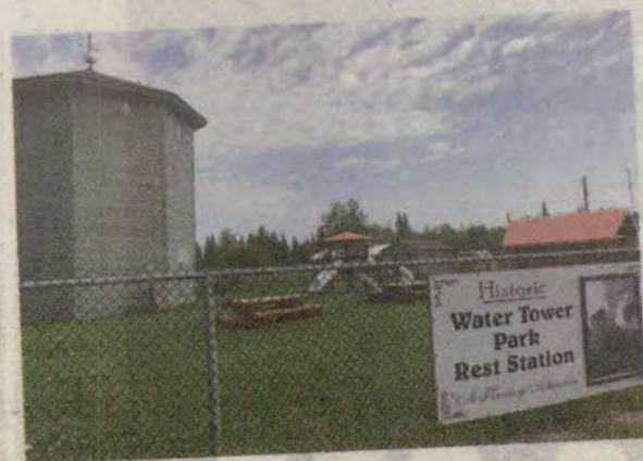
Lone Butte's water tower celebrating 100 years