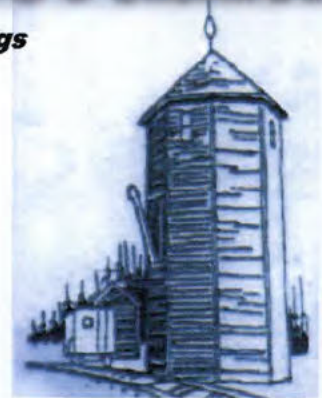
Last standing Watertower on the BC Rail line

Cariboo Regional District Suite D, 180 North Third Avenue Williams Lake, BC V2G 2A4