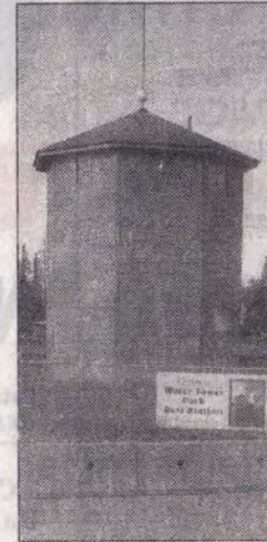
The freshly painted water tower.

The directors of the LBHA are currently working on opening the washrooms located in Water Tower Park for the remainder of the summer, although the park itself