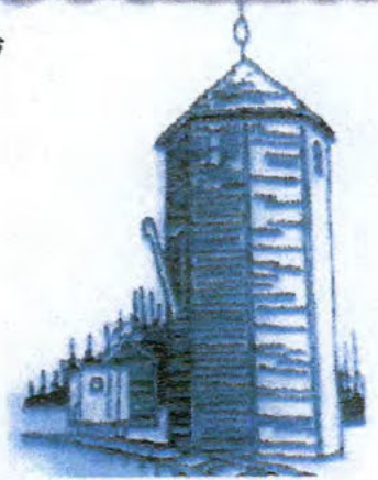
Last standing Watertower on the BC Rail line