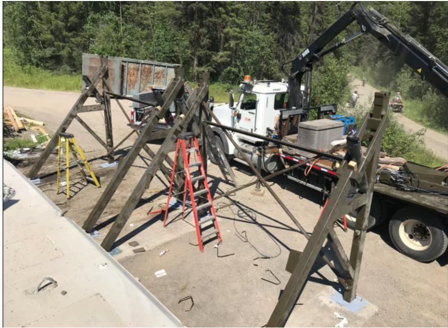
Replaced the existing and installed a new Transtor tipper bin at the Eagle Creek Transfer Station: Footings and frames in photo.