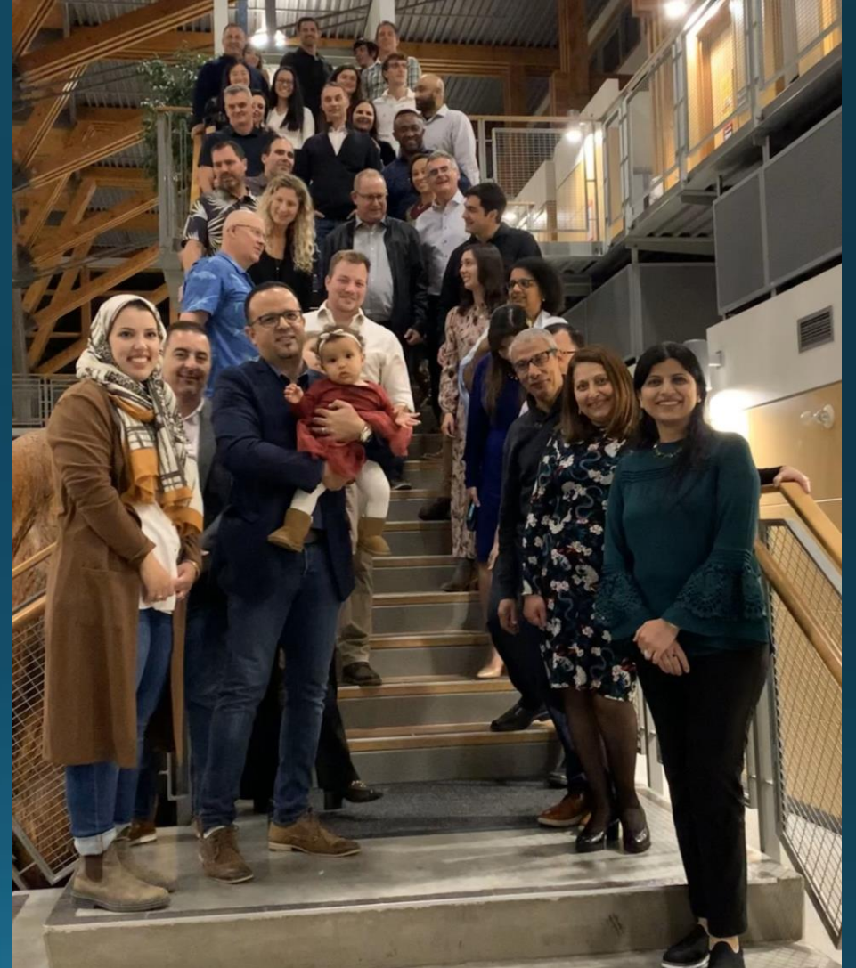
Medical Staff Providers Appreciation Gala, CNC/UNBC campus