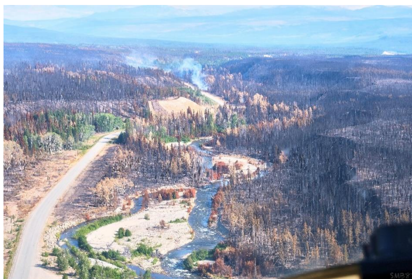
Figure 6. Big Stick wildfire, 2021.

These KPIs should be tailored to align with the specific goals of EPS (as they continue to evolve with regional growth and climate changes), and they should be regularly monitored and evaluated to track progress and make informed decisions about resource allocation and program adjustments and alignment.