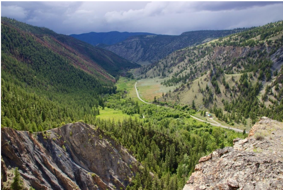
Figure 7. A narrow road in British Columbia's Cariboo Chilcotin region.

The Cariboo Regional District Emergency Program Services Strategic Plan represents a collective effort to safeguard the well-being of our communities and minimize the impact of emergencies on our residents, businesses, and infrastructure. Through proactive planning, collaboration, and resilience-building initiatives, we aim to create a safer and more prepared region for generations to come.