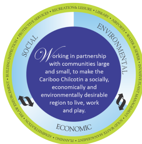
Figure 2. CRD Mission Graphic