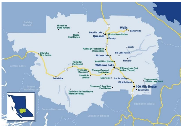
Figure 1. Map of the CRD

Incorporated in 1968, the CRD has 12 electoral areas and 4 incorporated municipalities. Municipalities include Quesnel, Williams Lake, 100 Mile House, and Wells. The region's boundaries sit on the traditional territories of the Dakelh, Secwépemc, and Tsilhqot'in Nations.