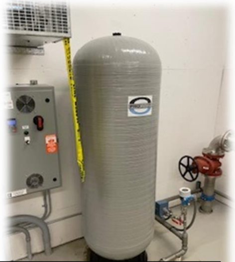
Gateway System Pressure Tank (No Reservoir)

The Cariboo Regional District is a signatory to the Clean BC Climate Action Plan (formerly the Province of BC/UBCM Climate Action Charter) and has committed to continuing work towards carbon neutrality in respect of corporate operations.